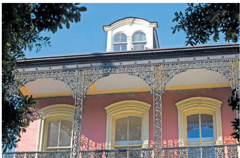
Above: Italianate segment arches frame the windows at 1235-37 St. Andrew St.

By the booming 1850s, Greek Revival came to feel a bit stodgy and dated. The nouveau riche wanted that trendy new Italian look, like their peers elsewhere, and designers were eager to deliver.