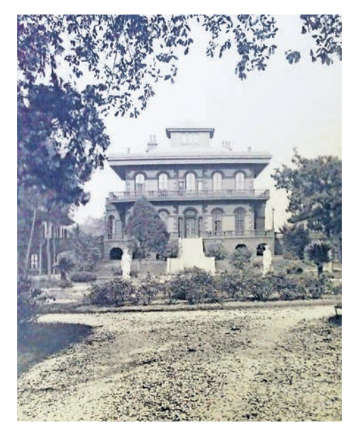
The Luling Mansion, pictured circa 1910, is an example of high Italianate style. Photogra-

A number of factors brought forth the appeal of Italianate. One overarching driver was the rise of the Romanticism movement, itself a reaction to the lofty ideals of the Enlightenment and the expanding domains of science and industry. Romanticism responded by celebrating emotionality, passion, the specialness of the individual and the beauty of nature.